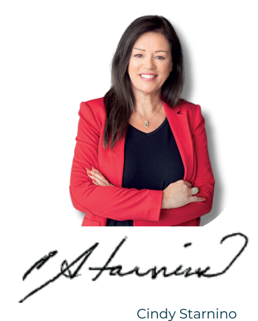
Administrative Director of the Observatory

To conclude, my sincere thanks go out to our team and their unflagging efforts to offer original, reliable and objective productions aimed at raising both awareness of caregiving and the visibility of the Observatory. I have every confidence that the Quebec Observatory on Caregiving is here to stay and that it will only continue to develop, deploying its mission for many years to come, working in tandem with its partners and the different caregiving stakeholders.